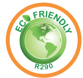
BKL ICE DUO EF